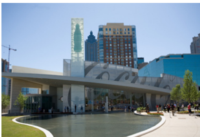
The new World of Coca-Cola

To see a slideshow of photos from the Westside TAD, visit ADA's Flickr page at http://www.flickr.com/photos/52764539@N08/sets/72157624652908152/show/ .