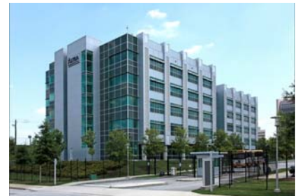
Technology Enterprise Park