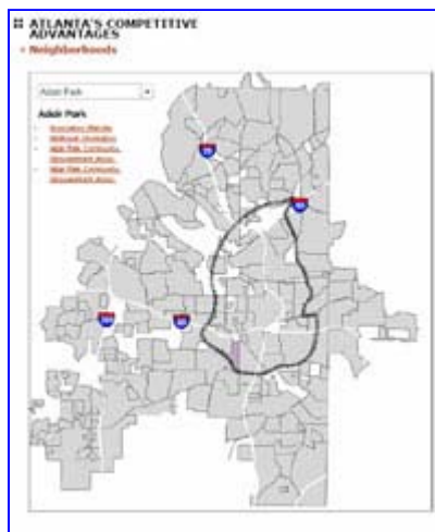
Click Image For Interactive Map

A new addition to ADA's website will help connect you to Atlanta's best asset - our over 200 distinctive and culturally rich neighborhoods. The map is interactive with links to neighborhood websites. This map will connect you with neighborhood associations, local schools and business associations. Use the map to choose the neighborhood that is right for your business or just to learn more about the great things happening everyday in Atlanta's neighborhoods.